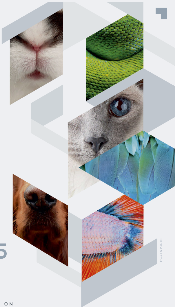
FACCI & PULLINI

17 TH INTERNATIONAL EXHIBITION OF PRODUCTS AND ACCESSORIES FOR PETS zoomark.it/ bolognafiere.it/ info@zoomark.it