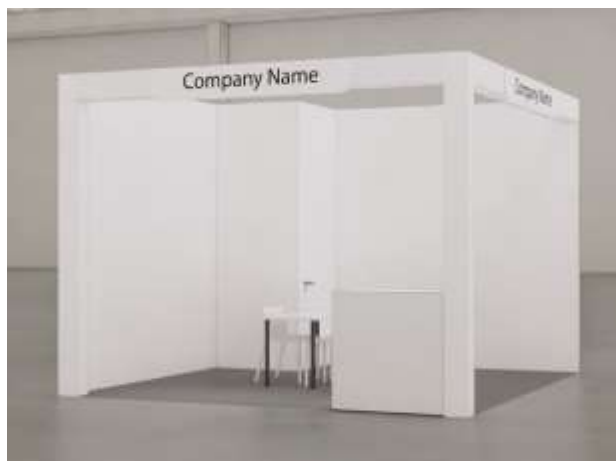
Front view – Stand with 2 open sides | sample image

For more information: zoomark.setup@henoto.com