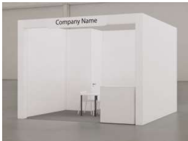
Front view – Stand with 1 open side | sample image