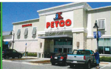
USA A shift in retailing