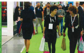
Zoomark Major retrospective