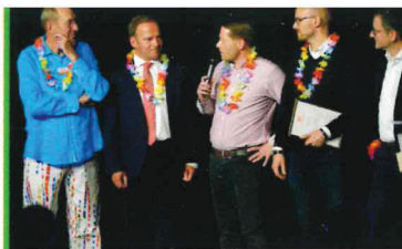
Das Futterhaus In the mood to party