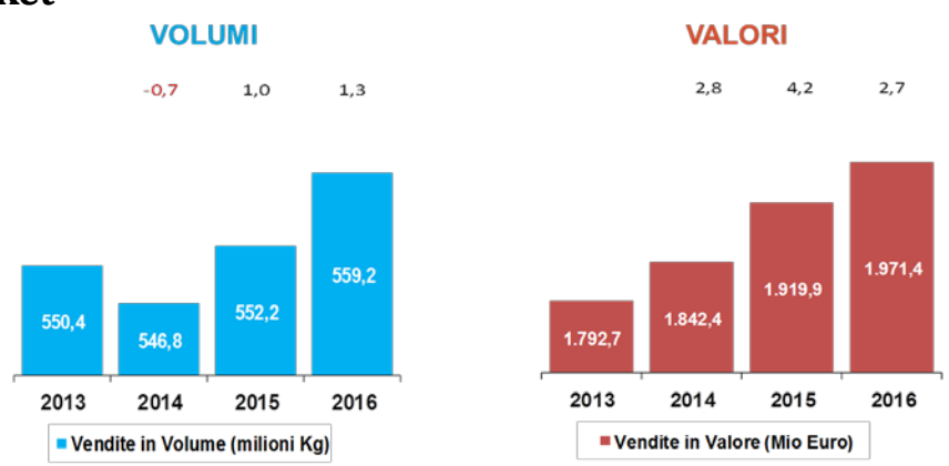
(VOLUME: Sales volumes in million Kgs)(VALUE: Sales in million euros)

The Italian Market (Grocery + traditional Pet shops and Pet shop chains)